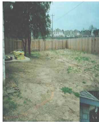
Plan ahead—it will save water and work.