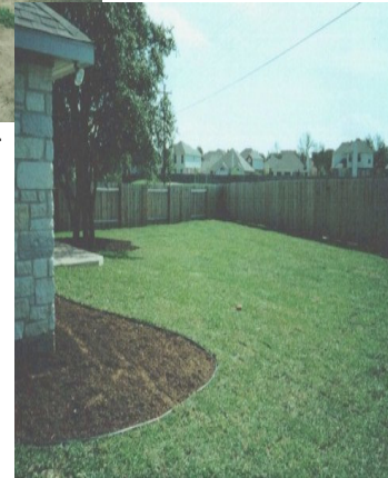
An efficient system will save time and money.